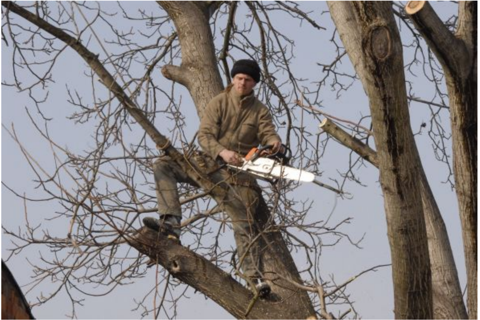
Cutting off branches